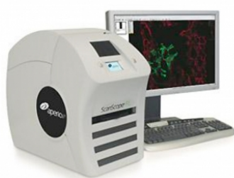
ScanScope FL Fluorescence